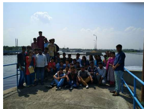
Students visit to sewage water treatment plant, Hyderabad