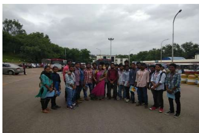
Students at Nuclear Fuel Complex, Hyderabad